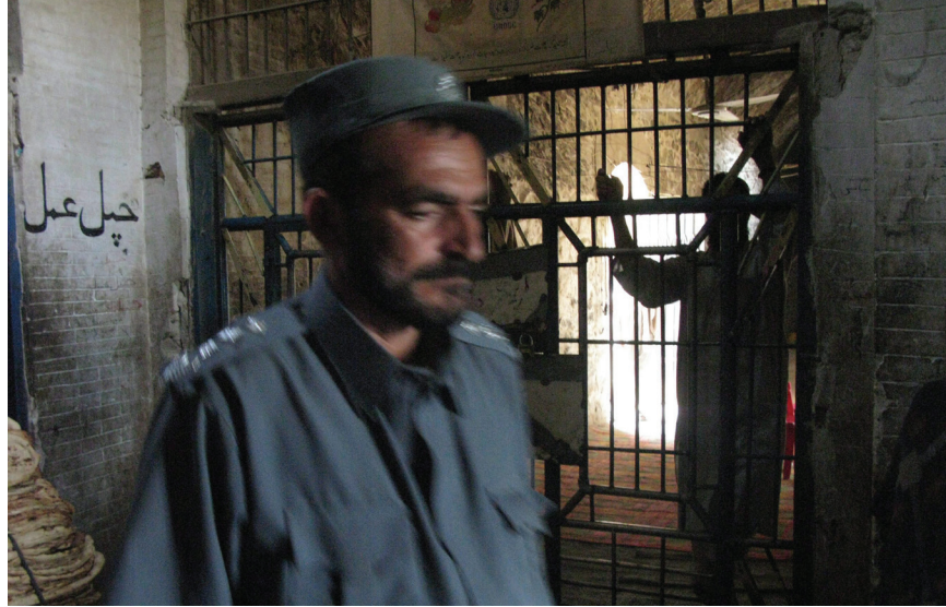
A prisoner leans against the entrance to a wing of Sarpoza Prison in Kandahar, in this 2009 file photo.

to Canadian national security. The government finally released some statistics on detainees in September 2010, over four years after Canada began transferring detainees to Afghan authorities.